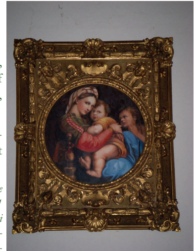
“Madonna of the Chair” by Raphael

Note: The original Madonna of the Chair was painted by Raphael in 1541 in Italy and acquired by the Medici Family. In 1799, it was taken by Napoleon’s troops to France, but was returned and is now on display in the Galleria of the Pitti Palace in Florence, Italy.