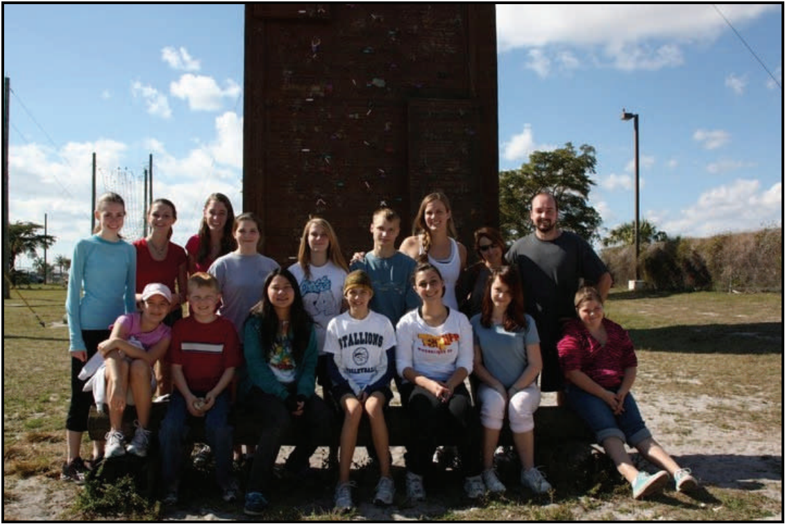
At the Ropes Course